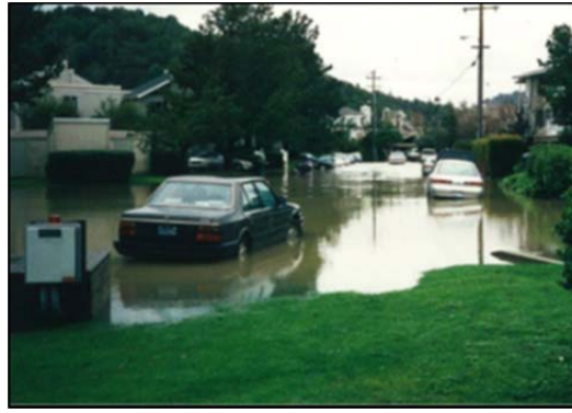
Flooding on Larkspur Plaza Drive, 1998

Requests for accommodations may be made by calling (415) 473-4381 (Voice/TTY) or 711 for the California Relay Service or by email at disabilityaccess@marincounty.org .