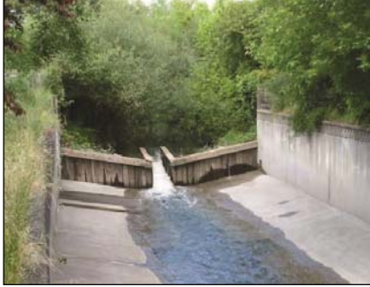
Unit 4 Channel Fish Ladder