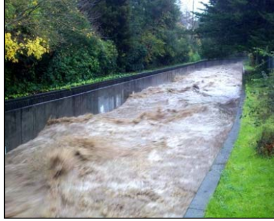
Flood waters in Unit 3 Channel In Ross