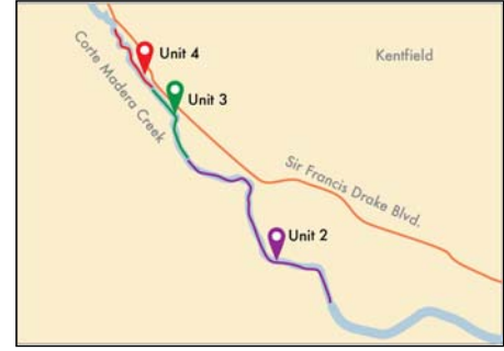
Unit 4 Project within the Ross Valley Watershed