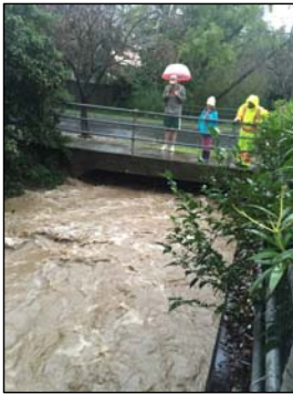
High creek flows at Broadmoor Ave. bridge 12/11/14