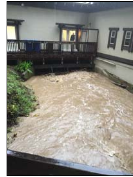
High creek flows at Fairfax Town Hall 12/11/14