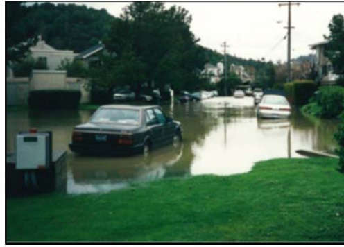
Flooding on Larkspur Plaza Drive, 1998

Requests for accommodations may be made by calling (415) 473-4381 (Voice/TTY) or 711 for the California Relay Service or by email at disabilityaccess@marincounty.org .