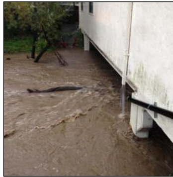
High creek flows at downtown San Anselmo 12/11/14