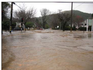
Downtown San Anselmo (Bollinas Avenue) during the 2005 Flood

For further information about the Program and proposed projects, please visit the Program website at www.RossValleyWatershed.org .