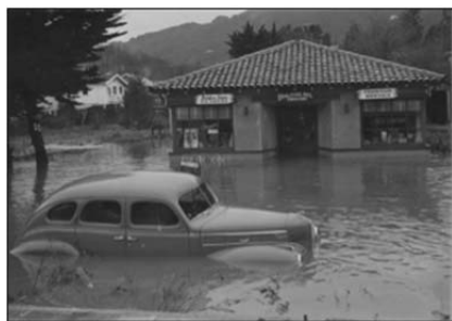
Downtown San Anselmo (Bollinas Avenue) during the 1944 Flood

The Marin County Flood Control and Water Conservation District and the towns/cities of Fairfax, San Anselmo, Ross, and Larkspur created the Ross Valley Flood Protection and Watershed Program (Program) after the devastating flood of 2005. The Program addresses issues of flooding and environmental stewardship to protect and enhance the Ross Valley watershed and its communities. The goals of the program are to reduce the risk of flooding using a watershed-wide approach; integrate environmental restoration features with the flood mitigation projects; and leverage funds obtained through the Ross Valley Storm Drainage Fee to secure state and federal grant funding to study and construct flood protection projects. The proposed bridge replacement, detention basin, and in-creek projects are part of the first phase of improving the level of flood protection in Ross Valley.