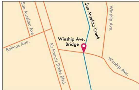
Winship Avenue Bridge Replacement Project within the Ross Valley Watershed