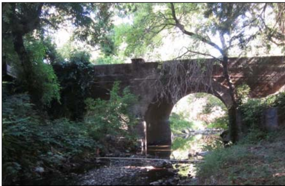
Winship Avenue Bridge