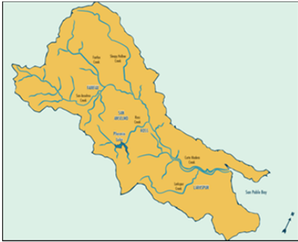
Creeks of the Ross Valley Watershed