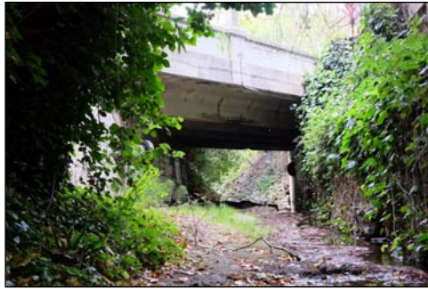
Azalea Avenue Bridge