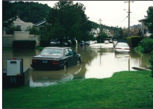
Flooding on Larkspur Plaza Drive, 1998

Requests for accommodations may be made by calling (415) 473-4381 (Voice/TTY) or 711 for the California Relay Service or by email at disabilityaccess@marincounty.org .