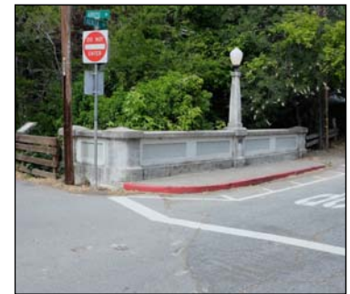
Azalea Avenue Bridge