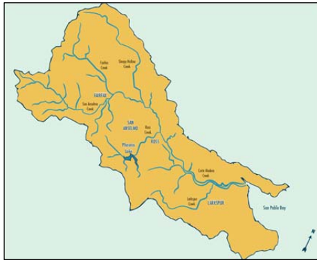
Creeks of the Ross Valley Watershed